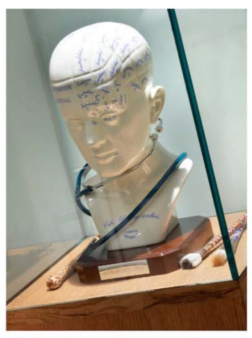
Left: A parcelain phrenology head, a stethoscope, and Japanese pointbrushes greet diners in the entry.

Opposite: Halogen step lights shine on quotations from the chef, stenciled on the steel risers of the staircase down from the street